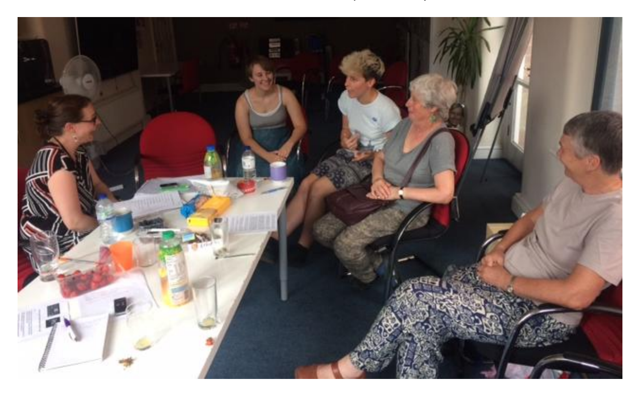
Photo 3 – Lesbian and Bisexual Women Focus Group – 16<sup>th</sup> July 2018